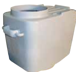
25 Gallon Hopper