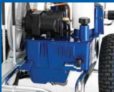
High-Capacity Cooling System

MAX TIP SIZE: 0.029 MAX GPM (LPM): 1.3 (4.9) MAX PSI (BAR): 3300 (227) HONDA GX ENGINE CC (HP): 120 (4.0) WEIGHT LBS (KG): 242 (110)