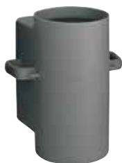
15 Gallon Hopper