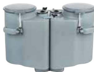
Dual 15-Gallon Hoppers